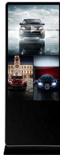
Split into 3 screens