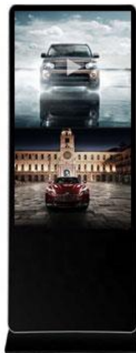
Split into 2 screens